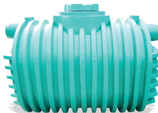
750 US Gallons Septic Tank