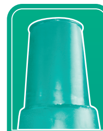
Filter Port Extension