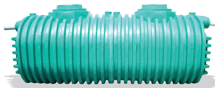
1500 US Gallons Septic Tank

All Rhino Septic Tanks are manufactured from Prime Grade Linear Polyethylene and are: