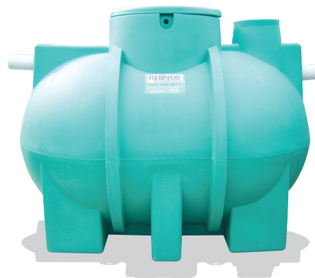
600 US Gallons Septic Tank